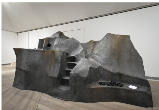
Figure 3: Goldin+Senneby: Headless: Each Thing Seen Is the Parody of Another or Is the Same Thing in a Deceptive Form (sound installation, 2010). Moderna Museet, Stockholm.

Something that I find surprising is the lack of literature on novels written by artists, let alone the artist's novel. This is not the case with poetry. Surrealist poetry, Visual poetry, Concrete poetry and, more recently, Uncreative writing, they are all well-known hybrids between poetry and the visual arts. I would like to know your opinion about the difference in the interest historically stirred in the art world by these two literary genres.