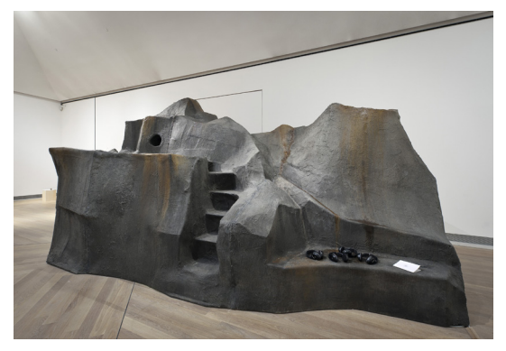
Figure 3: Goldin+Senneby: Headless: Each Thing Seen Is the Parody of Another or Is the Same Thing in a Deceptive Form [sound installation, 2010]. Moderna Museet, Stockholm.

Something that I find surprising is the lack of literature on novels written by artists, let alone the artist's novel. This is not the case with poetry. Surrealist poetry, Visual poetry, Concrete poetry and, more recently, Uncreative writing, they are all well-known hybrids between poetry and the visual arts. I would like to know your opinion about the difference in the interest historically stirred in the art world by these two literary genres.