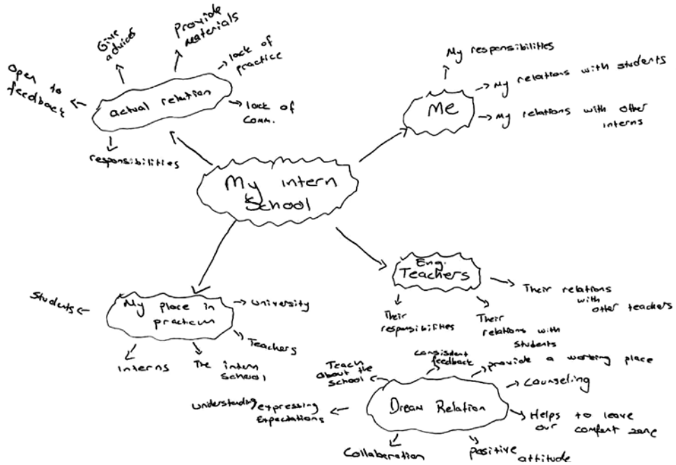
Figure 1. Graphic elicitation 1