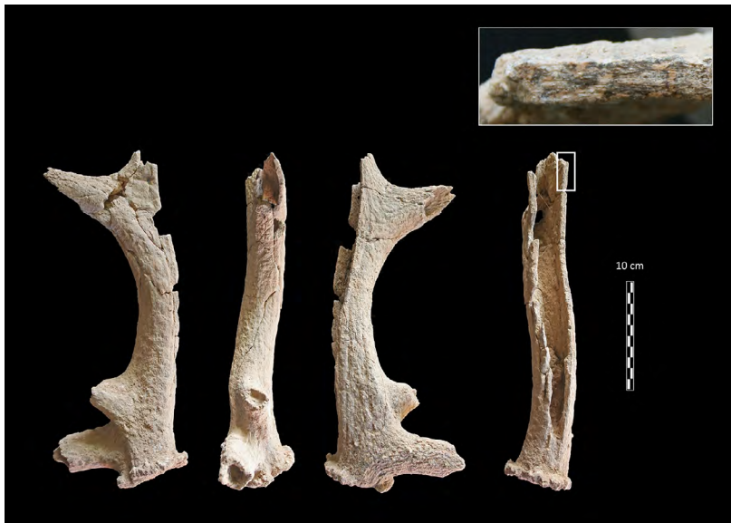
Fig. 5.—Different views of the shed antler beam found in La Arruzafa (Córdoba), with evidence of blank removal by grooving.