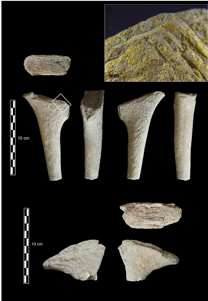
Fig. 3.—Elbow shaped antler from La Minilla, found in 1986 (MN86 BS3-586) (above), with some details of technological grooves. Below, antler object (MN89 Z14-656) found at level 4 of Ditch 1, in La Minilla site.

The first specimen (MN86 BS3-586) (fig. 3, top), found in structure S3, connected to Ditch 1, retains the trez-tine and comes from a right-side antler. The antler blank was removed by repeated grooving (three to six grooves can be observed, see figure 3, above) parallel to the main beam and in a perpendicular direction over the tine. Even though the edge of this tine is slightly damaged, the former length would have been approximately 140 mm. The second specimen (MN89 Z14-656) (fig. 3, below), came to light in a lower level (4) of Ditch 1. The complete tine