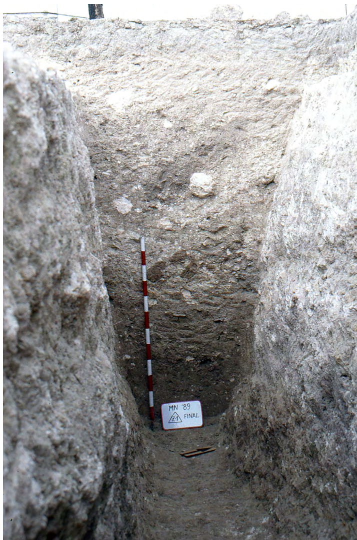
Fig. 2.—Section view of the Ditch 1 (Z 1), during the archaeological survey of 1989.

Both ditches, reaching to a depth of 2 m, contained large numbers of faunal remains, mostly composed of domestic mammals (pigs, caprines, and cattle), followed by red deer, leporids and bird bones (Martínez and Ruiz, in press) in the bottom levels. Two antler objects were discovered in the northern ditch, mixed with the faunal remains. Both were made from part of the antler rack between the beam and the trez-tine or bez-tine . The segment was detached by grooving from the rest of the beam.