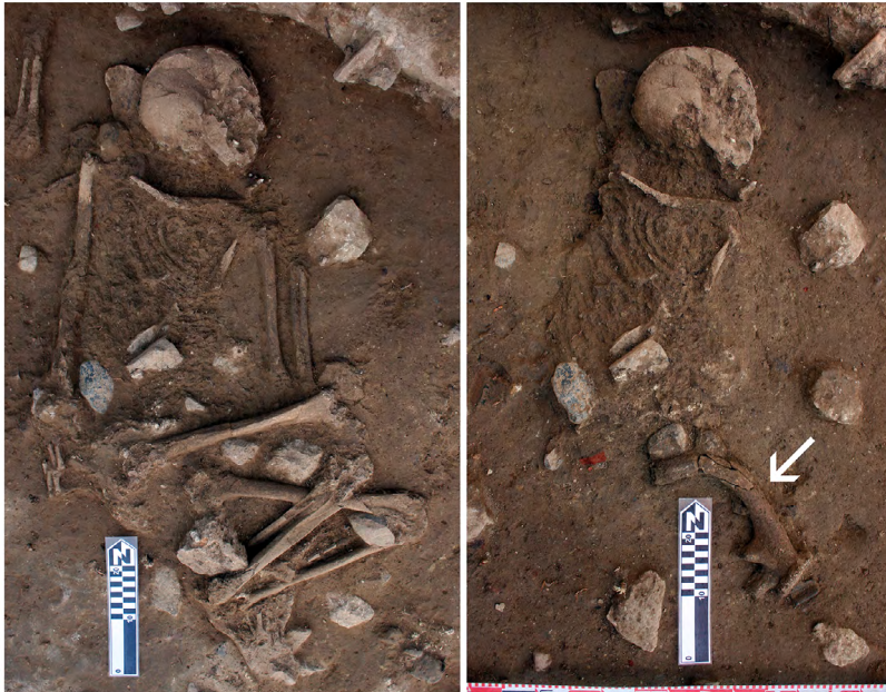
Fig. 4.—Mature male burial (Ind. 422), placed in a collective grave, and deposited over an antler beam. Right picture, pointed with a white arrow (picture taken once legs bone were removed). La Arruzafa (Córdoba).