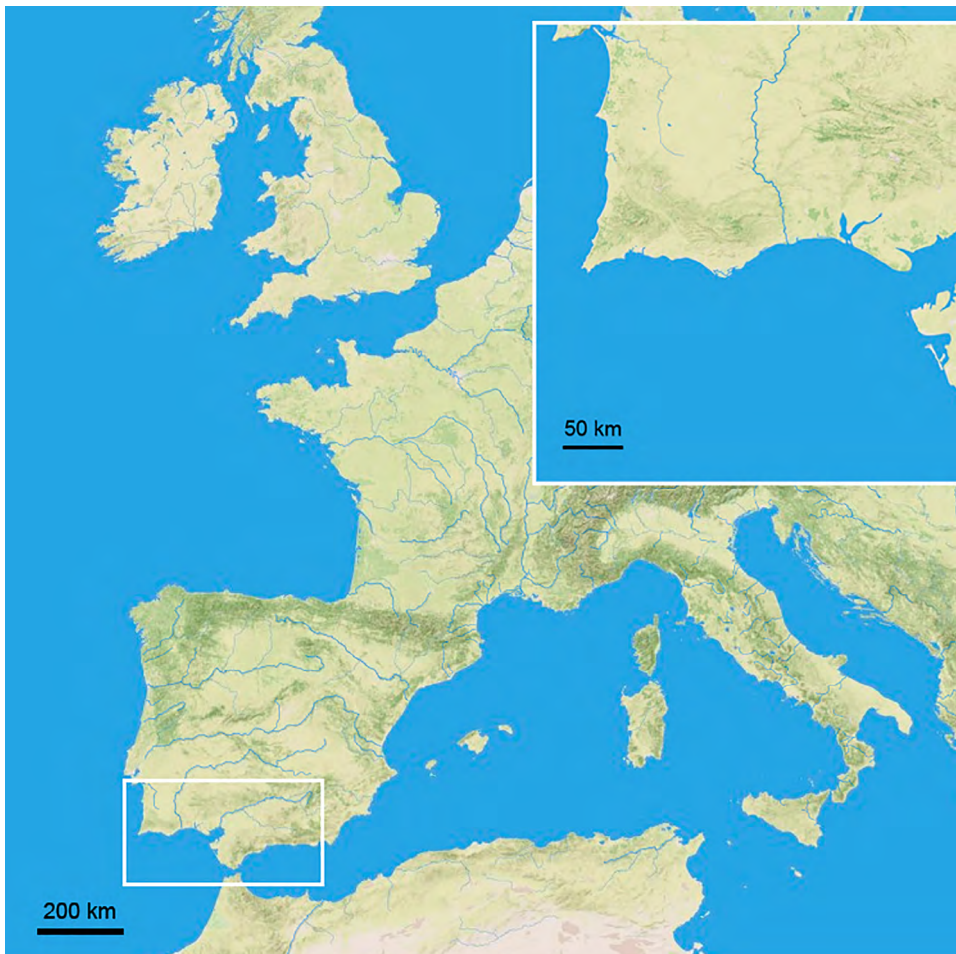
Fig. 1.—Map of location of two sites mentioned in the text, in southern Iberia. Black star, La Arruzafa (Córdoba); grey star, La Minilla (La Rambla).

The archaeological site of La Minilla sits in the urban area of La Rambla Municipality, in the western Cordovan countryside, located between 37°36'42.04"N and 4°44'17.67"O. The site was recognized in 1985, after a chance discovery of two completely intact bell beakers, likely provenant of a funerary context. Excavations were carried out between 1986 and 1989 by Dr. Ruiz Lara (Ruiz, 1987, 1991). These works partially revealed, among other structures, two parallel ditches that likely were part of a ditched enclosure connected to a prehistoric settlement (figs. 1 and 2).