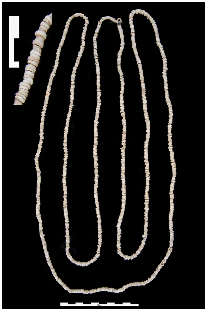
Fig. 7.—Beads from Tomb 40. Museo Arqueológico Nacional. MAN 1976/1/MILL/40/189.

determine the identification of ostrich's egg for the preparation of disc-shaped beads (Siret, 2014 [1908]:86-87). Through this study, the author identified around 800 in burial 12 and 21 in burial 63.