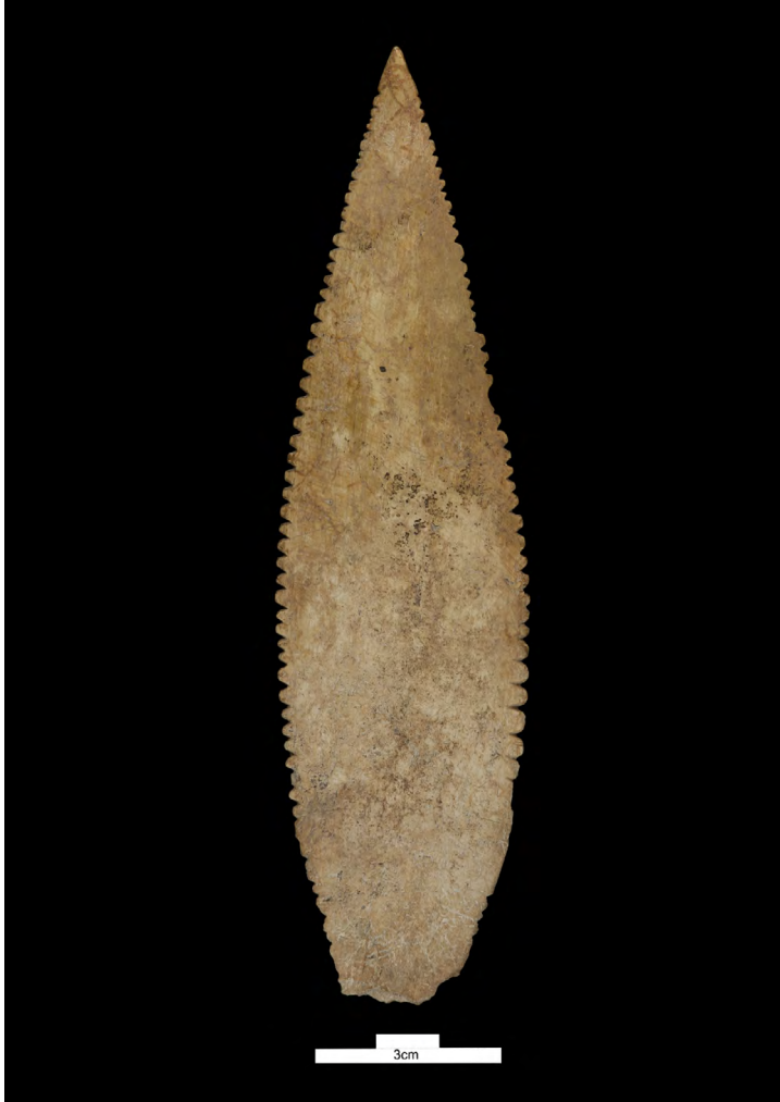
Fig. 4.—Serrated dagger from Tomb 7. Museo Arqueológico Nacional. MAN 1976/1/MILL/7/87.

slightly modified diaphyses to gridded decorated objects, in which perforations for fastening are seen.