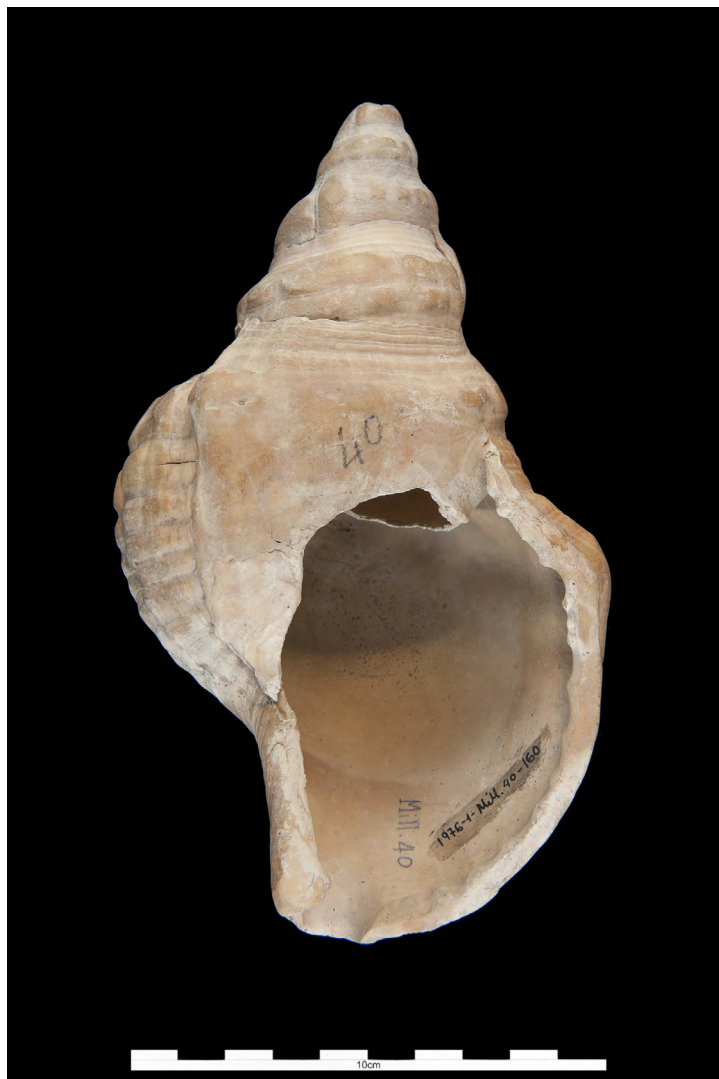
Fig. 8.— Charonia nodifera from Tomb. 40. Museo Arqueológico Nacional. MAN 1976/1/MILL/40/160.

the bone industry. Nevertheless, we observe a selection of taxon that is not directly related to environmental availability, so other causes can be argued, probably symbolic or identity aspects.