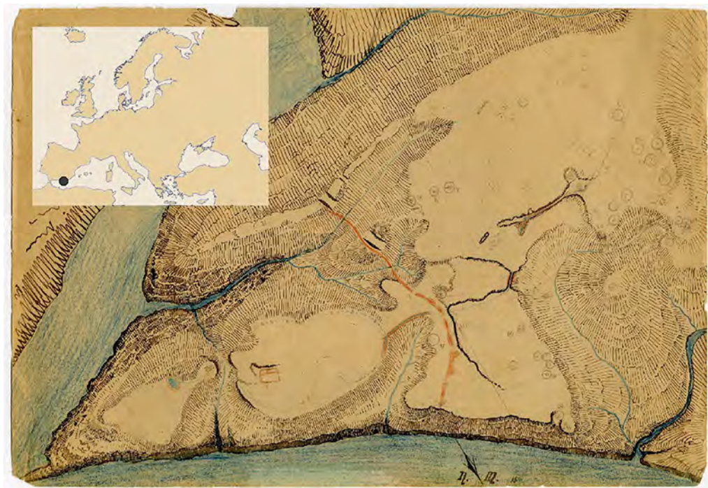
Fig. 1.—The location of Los Millares in the Iberian Peninsula and the detail of the first Siret map of the site (Los Millares manuscript MAN 1944/45/FD01439_003c).

other documents like the “ Diccionario ”, a heterogeneous collection of documents organized in alphabetical order (Maicas, 2014:179-194).