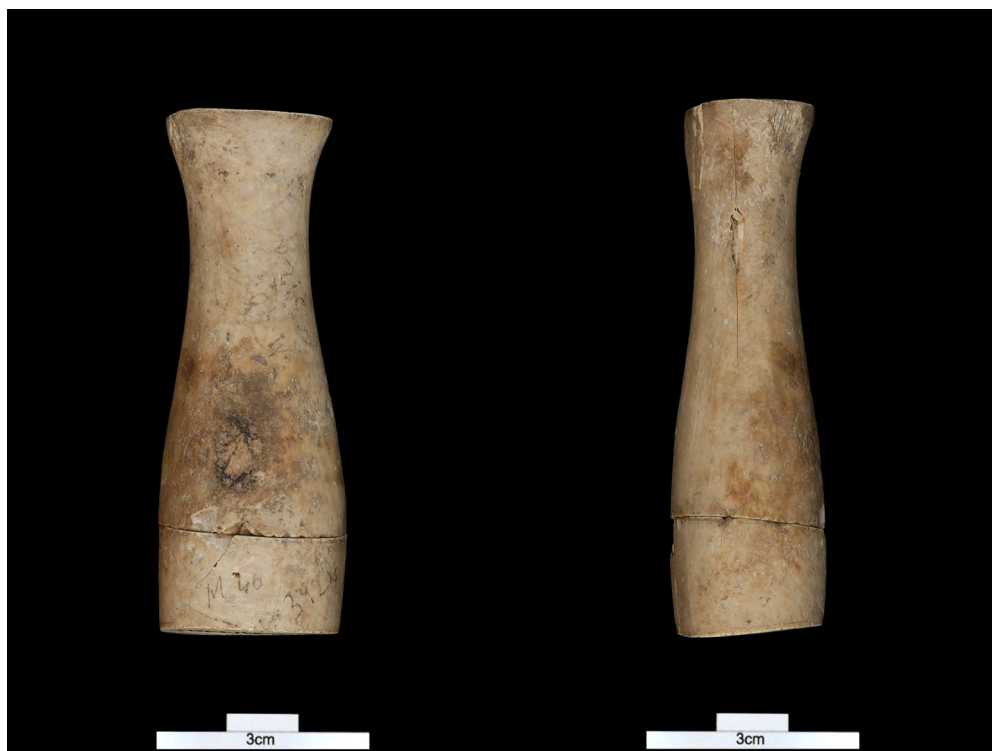
Fig. 3.—“Tolva idol” from Tomb 40. Museo Arqueológico Nacional. (MAN 1976/1/MILL/40/145.