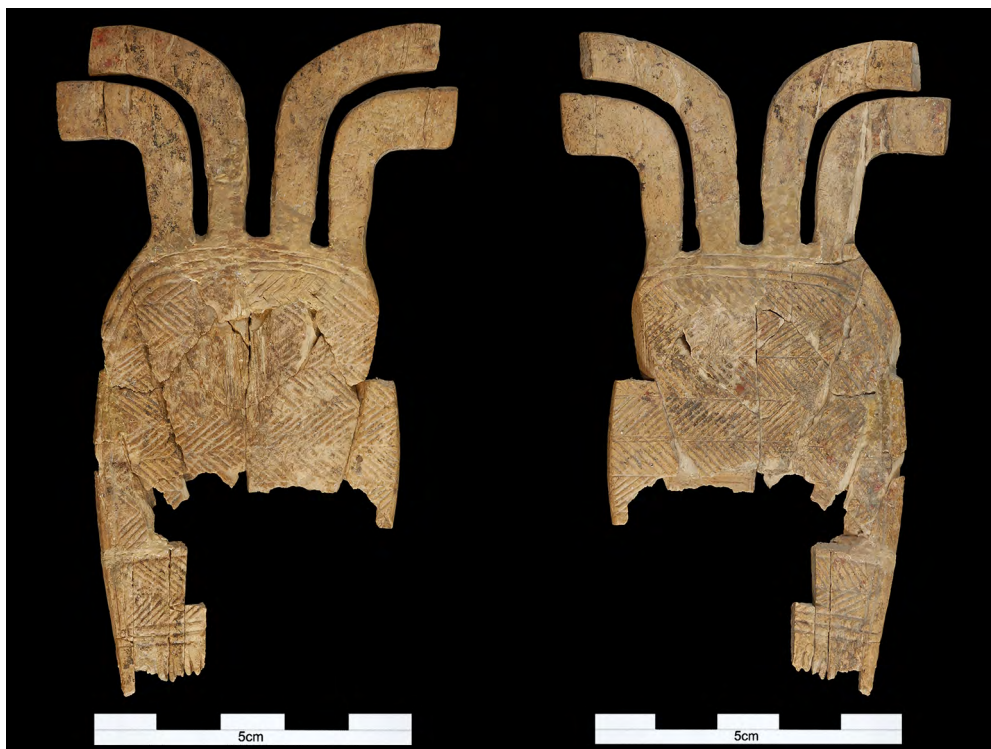
Fig. 5.—Comb from Tomb. 12. Museo Arqueológico Nacional. MAN 1976/1/MILL/12/16.

fragment of the second one. The recent findings in the South of the Iberian Peninsula (Valencina area) also include similar plaques. Our large gridded plaque could be functionally similar to the objects recovered in recent research (scabbard for knife). Both the sleeve of the dagger from Montelirio and a large semicircle with stressed and perforated decorations present very similar manufacture to our plaque, with the same kind of perforated borders that are only located in the bigger sides of the piece (Luciañez and García San Juan, 2016: fig. 13).