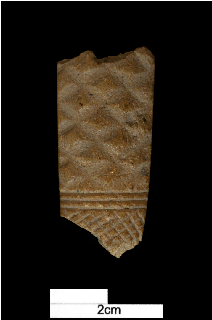
Fig. 6.—Rod from Tomb. 40. Museo Arqueológico Nacional. MAN 1976/1/MILL/12/16.

bone beads, and they are very simple. They form two groups: cylindrical beads made on the long diaphysis of the lagomorpha and birds with a perpendicular cut and barrel-shaped beads with an intensely worn-in diagonal direction. There are over 3200 disc-shaped beads in Tomb 12, but as we do not exactly know what their original position was, we cannot determine their use. For museographic needs they have always been presented as necklaces (fig. 7). Siret requested experiments to