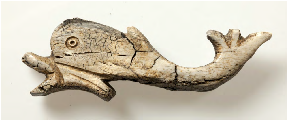
Fig. 5.—Left and right side of the dolphin from Kaiseraugst- Im Sager 1991.002.C07596.2. Length 6.5 cm.