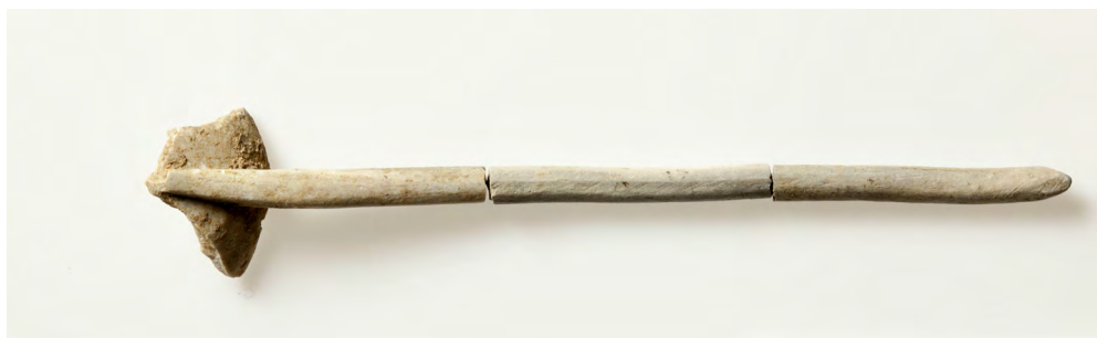
Fig. 2.—Three fragments of a spoon from Kaiseraugst- Im Sager 1991.002.C09392.19. Length ca. 6.5 cm.

decorated with a point. These points are regularly found on spoons that are typical of the 1st century AD. This detail can be helpful for the identification of such objects even when the fragment is very small. However, that cannot be said about the handle fragments. When such rods are found in isolation they could also be identified as part of a hairpin (Deschler-Erb, 1998:159-166) or a needle (Deschler-Erb, 1998:140-142), so their function cannot be determined with confidence.