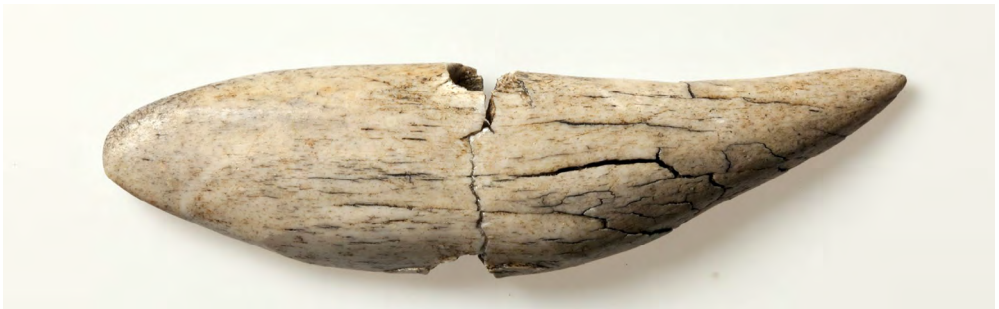
Fig. 6.—The dolphin/fish (?) from Kaiseraugst- Im Sager 1991.002.C07612.4. Length 5.7 cm.