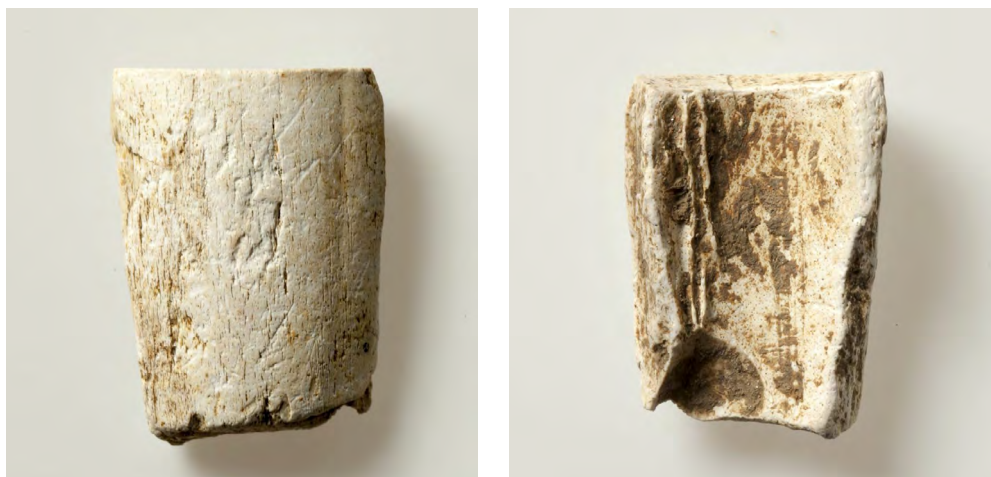
Fig. 3.—Outside and inside of a hinge from Kaiseraugst- Im Sager 1991.002.C09190.70. Length 1.8 cm.

cylinder. The craftsmen obviously stopped drilling too late and touched the opposite side with the drill, so that is the proof that we have a fragment of a hinge. Roman bone hinges are cylinders, usually with one or more holes, into which wooden plugs were fitted, and used as pivots for doors and lids (Deschler-Erb, 1997; Deschler-Erb, 1998:182-189). The object shown in fig. 4 is worked on the outside and the inside. The border is not straight-edged like the hinge, but rounded. Furthermore, there is a shallow rim carved on the inside margin. That can only be found on so-called pyxides . The bottom or the cover of the pyxis was set upon this rim. Pyxides were used as containers for unguents and creams and were often placed in the grave as personal effects of the dead (Béal/Feugère, 1983; Deschler-Erb, 1998). This shows that different technical details can help to identify bone artifact types.