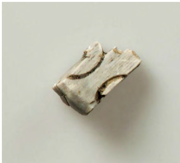
Fig. 1.—The fragment of a dice from Kaiseraugst-Im Sager 1991.002.C09367.157. Length 0.5 cm.