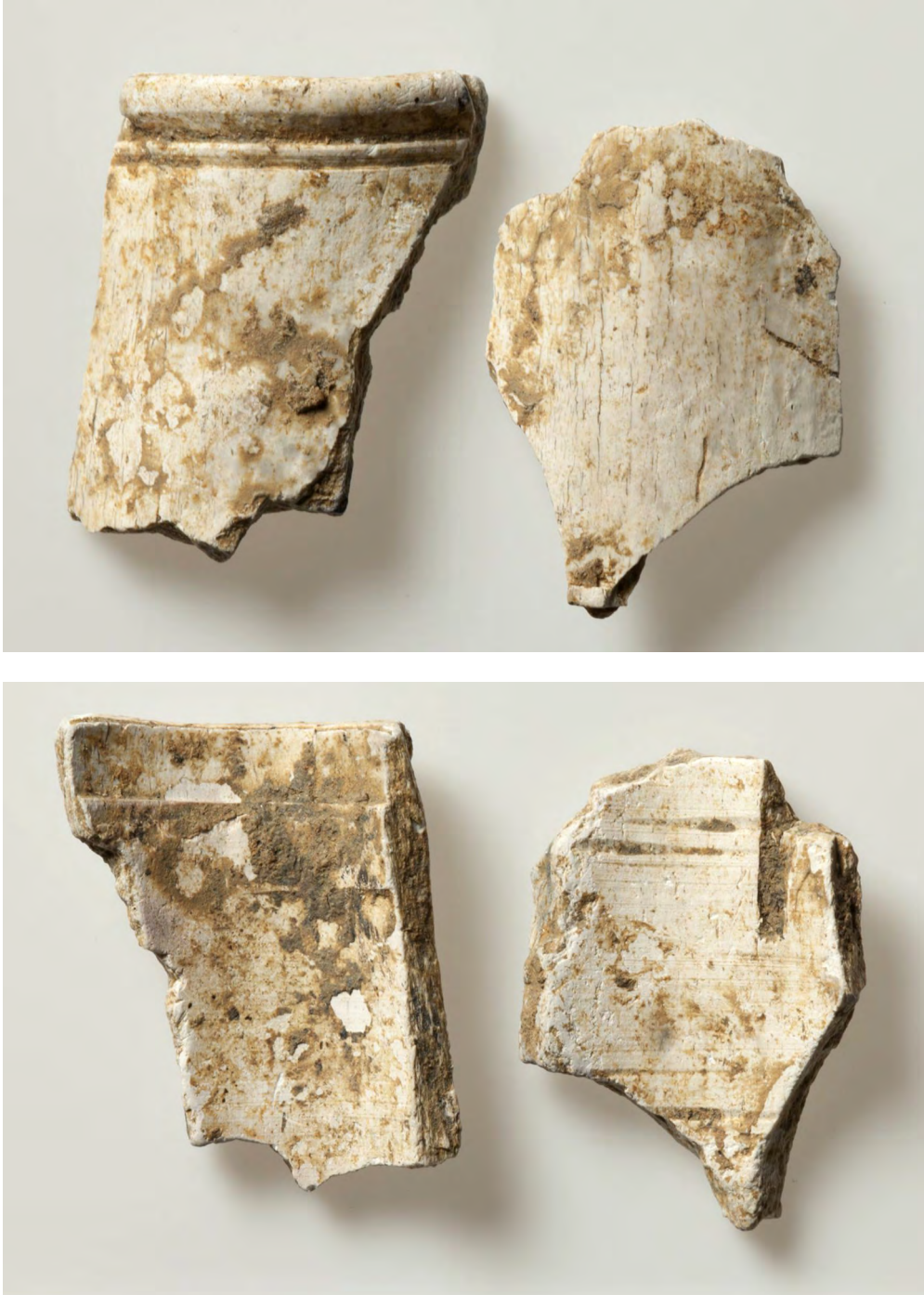
Fig. 4.—Outside and inside of a pyxis from Kaiseraugst- Im Sager 1991.002.C09048.24. Length ca. 2 cm.