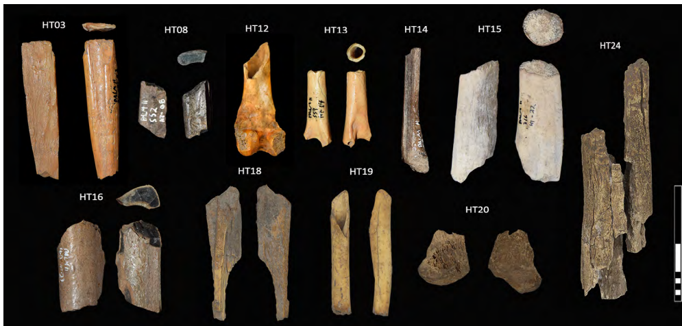
Fig. 4.—Other bone and antler tools and wastes.

in order to obtain a \frac{1}{2} awl it was necessary to make two longitudinal cuts to the long bone, separating it into two halves and selecting one of the ends to make it pointed. For \frac{1}{3} and \frac{1}{5} awls and for the \frac{1}{8} rod, it was necessary to make three, five and eight longitudinal cuts, respectively.