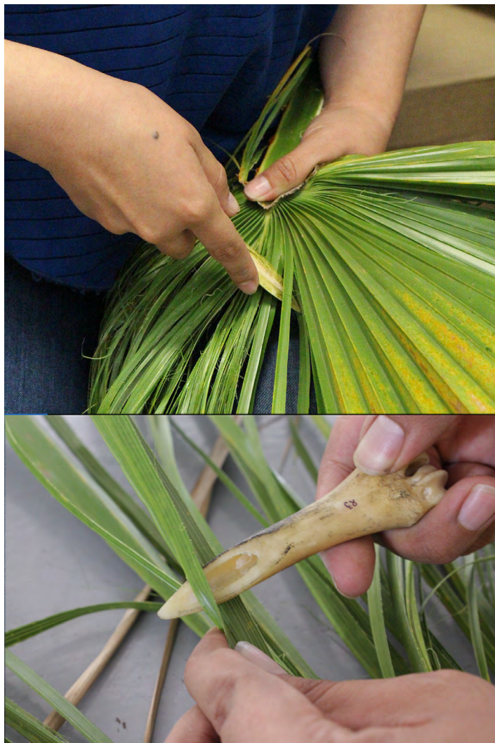
Fig. 6.—Experimentation with vegetable fibers for basketry.