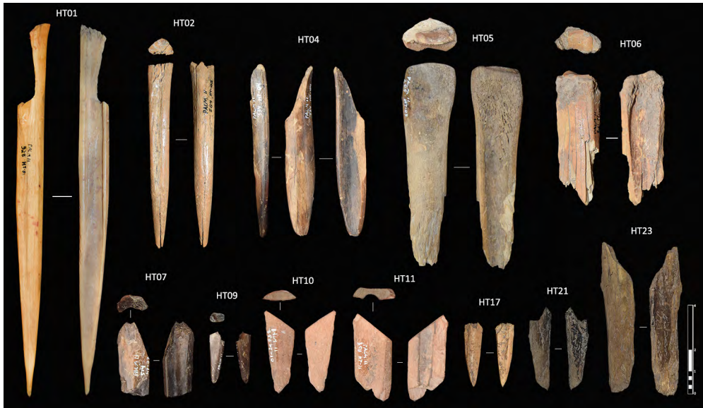
Fig. 3.—Awls and fragments of bone awls.