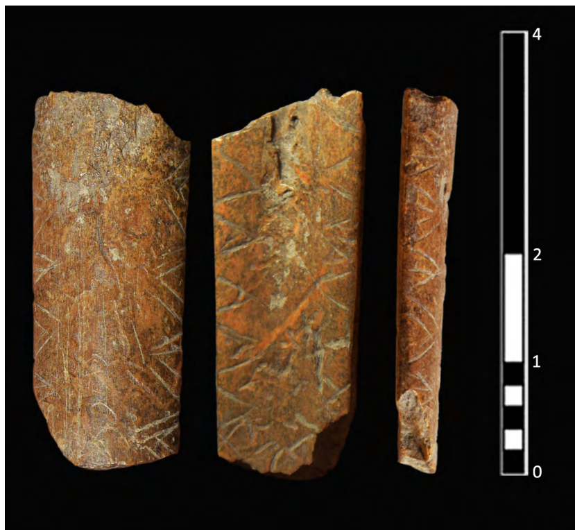
Fig. 5.—Detail of decorated artifact HT22.

A large majority of pieces (87.5%) show some kind of thermal treatment. Eight of them are boiled, eight of them were burnt at 300-700°C approximately, and five of them were roasted cooked, following the work of Pijoan and collaborators (Pijoan et al. , 2010). The rest of the sample, which includes three pieces, does not show any sign of apparent thermal treatment.