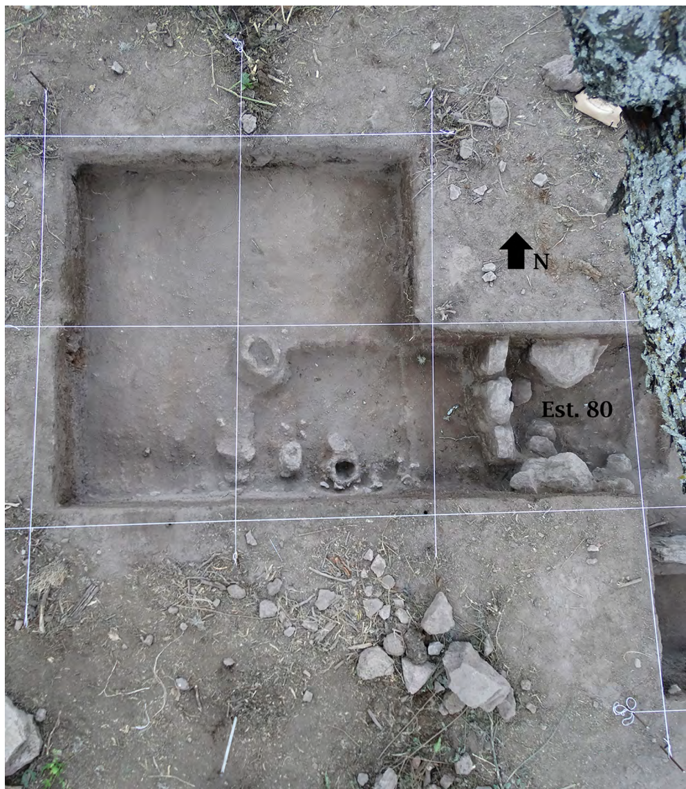
Fig. 7.—Excavation process in the 2016 season of structure 80.

present in La Montesita. It would be possible that this absence is due to different ideological practises related to the treatment of the human body, or perhaps because the site is still being excavated and we have not yet found this type of artefact. It would be best to wait and analyze the results obtained in future archaeological interventions.