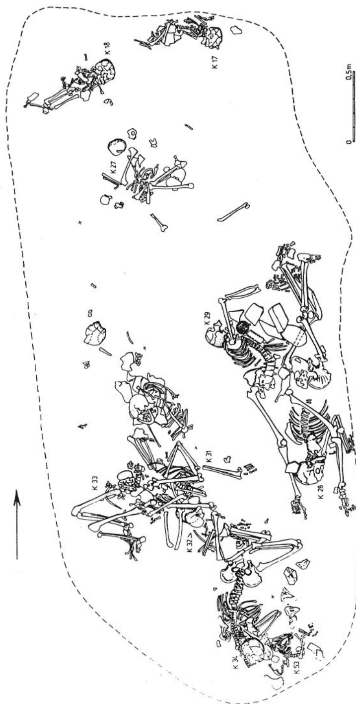
Fig. 1.—Velim-Skalka: Ditch E, Feature 30, Pit 2, plan of the scattered human bone remains.