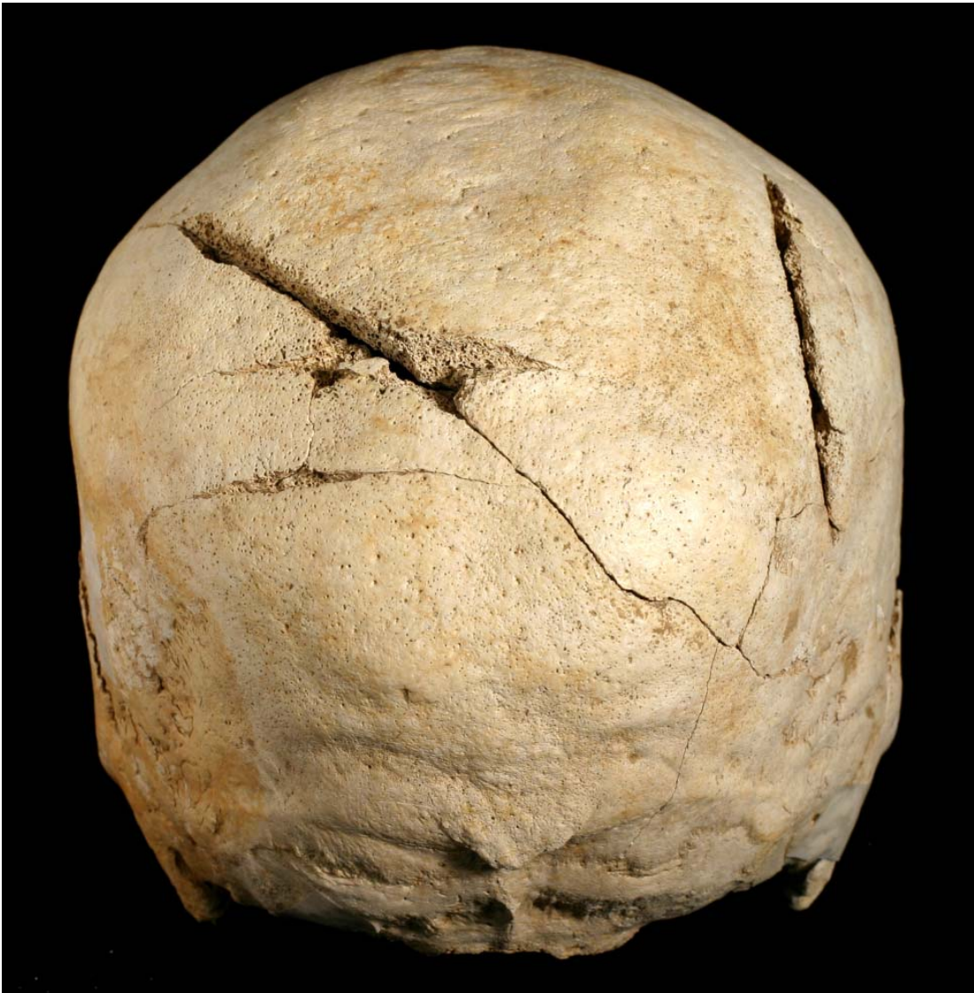
Plate VI.—Cliffs End Farm, Kent, UK: burial 3675, showing sharp weapon trauma to the back of the skull (© Wessex Archaeology, by kind permission).