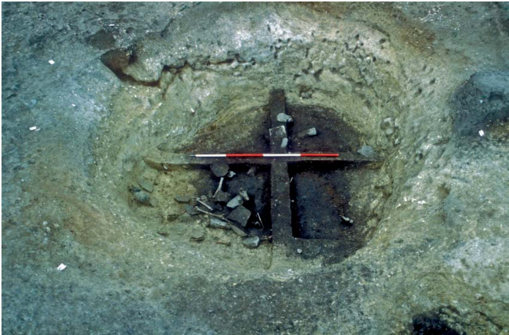
Plate I.—Velim, Pit 64, partially excavated, showing tumbled stone and bones.