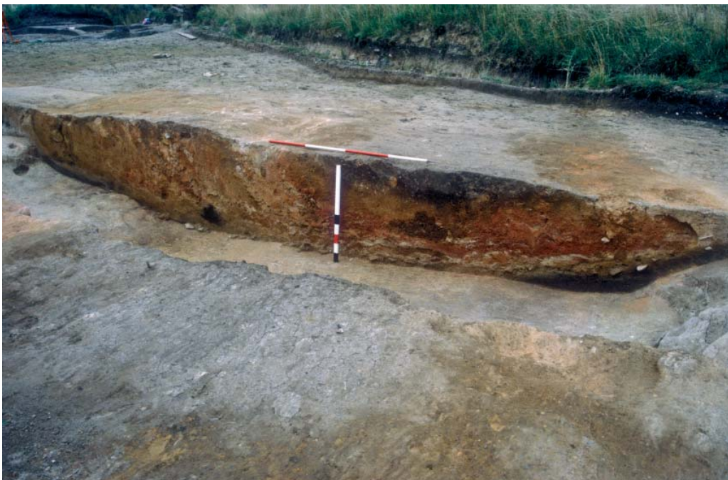
Plate II.—Velim, section through the fill of the “Red Ditch”, fortification H in Vávra’s nomenclature.