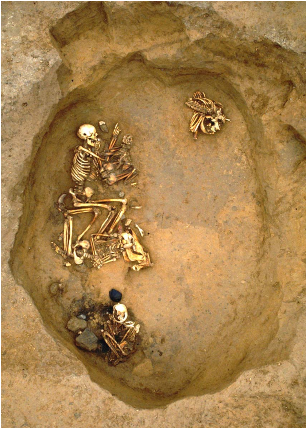
Plate V.—Cliffs End Farm, Kent, UK: pit 3666, showing the in situ human remains (© Wessex Archaeology, by kind permission).