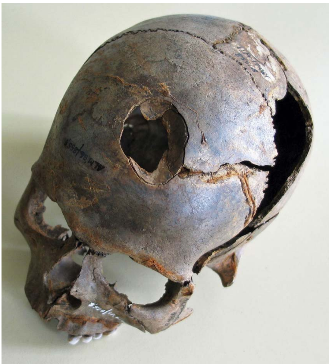
Plate IV.—Tollense valley, Weltzin site. Cranium with large wound (Photo: D. Jantzen, by kind permission of the Tollense valley research team and Antiquity).