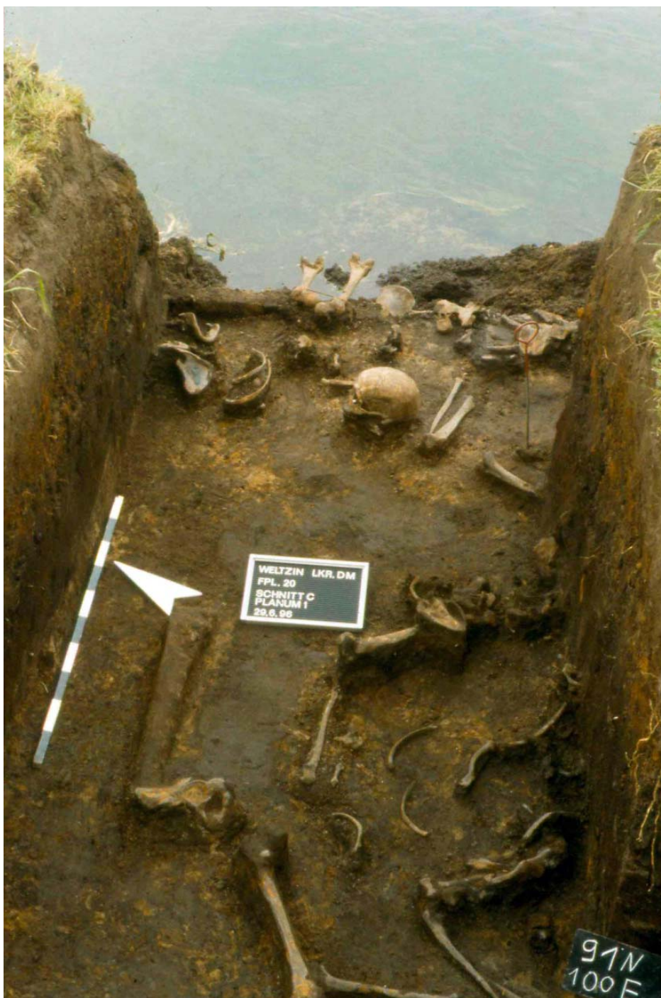
Plate III.—Tollense valley, Weltzin site. View of excavated area beside the river, showing scattered human bones.