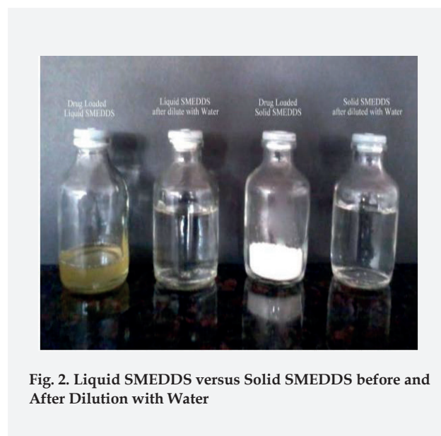
Fig. 2. Liquid SMEDDS versus Solid SMEDDS before and After Dilution with Water

bon nanotubes, carbon nanohorns, fullerene, charcoal and bamboo charcoal. 24