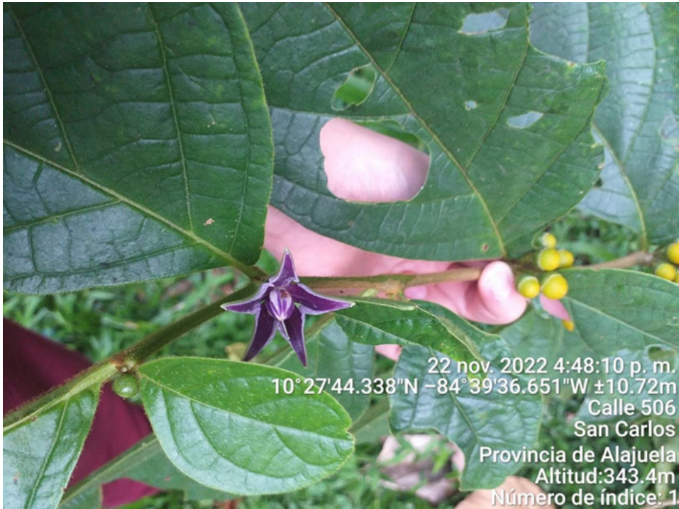
Image 2. Lycianthes sanctaeclarae located in San Carlos, Alajuela Province. Original photo, taken November 22, 2022.