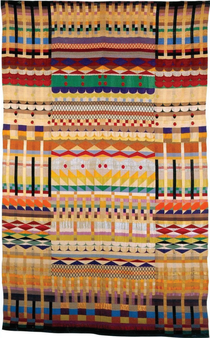
Il. 1. Gunta Stölzl "Five Choirs", made in the technique of jacquard weaving.